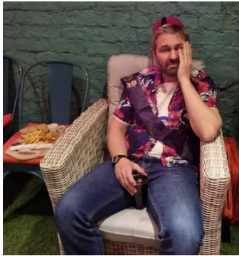
Early knockdown but got back up and partied on.....

Later this month (30 th ) I take the step into married life. And, in time honoured fashion, a Stag bash was held in bars across the Wirral to mark the occasion. A huge thanks to all those that attended and made it such a memorable (for those that can remember) and fun night. Cheers